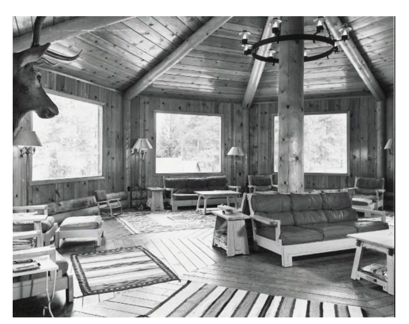
Onahu Lodge Lounge