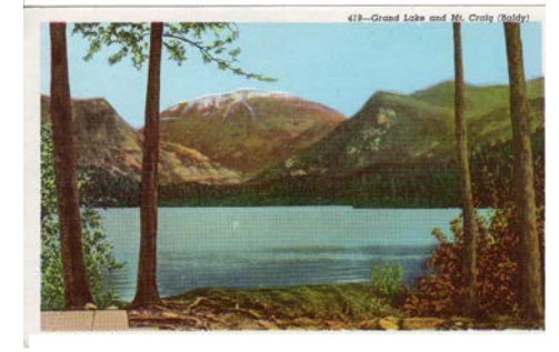
1939 Sanborn Postcard Advertising RMNP

The south shore of the lake was known by the old timers as Echo Mountain before being renamed Shadow Mountain sometime in the