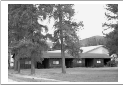
The Cottage Court about 75 years old, in 1991, on its original location off Grand Avenue, next to the bowling alley

The following is a photo sequence of events over the past couple of years associated with relocating the old motor court from its former location to its permanent new home on Lake Street.