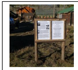
With a very generous outpouring of support from the community, more land was purchased, doubling the