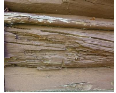
One Area Needing Restoration

The Kauffman House museum is undergoing an exterior renovation this summer. With a grant from History Colorado and donations from members, friends and visitors, the log exterior is getting some much-needed refurbishing. Local contractors will replace or repair logs that are damaged by rot, then the chinking between logs will be removed and replaced with historically accurate material. The existing chinking is a hodge-podge of materials, some of which is crumbling and allowing moisture to penetrate between logs. And finally, the entire log surface will be re-stained. Stop by this summer and watch the transformation!