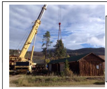
At last... the first- ever foundation under the Cottage Court! Thank you, State Historical Fund/History Colorado, Grand County and the Town of Grand Lake! 2015