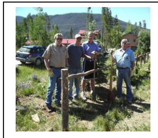
... and build a fence around the site 2011