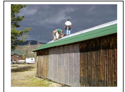
With generous support from the Grand Foundation, an authentic rolled roof is installed Fall 2012