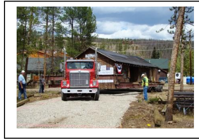
With community donations, the Court is moved "Foot by Foot" to prevent its demolition Fall 2009