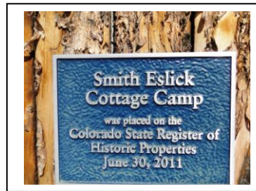
Placed on the Colorado State Register of Historic Properties 2011