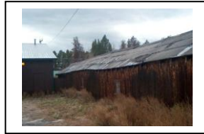
Original location, long neglected in 2009