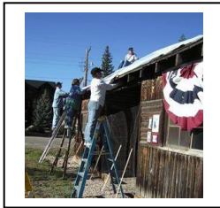
Volunteers cover the roof with protective plastic 2010