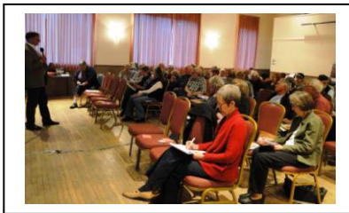
The Master Plan for the entire Cottage Camp site, supported by grants from the Hart Family Fund/National Trust and the Grand Foundation, was introduced in a community meeting; when audience members shared suggestions. June 2014