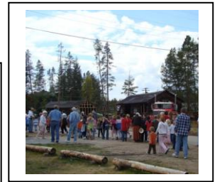
A crowd of folks come to watch the Cottage Court being professionally moved!