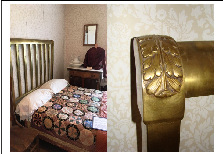
Brass Simmons Bed - 1910

3/4 size bed from the estate of Sue James-Stuart