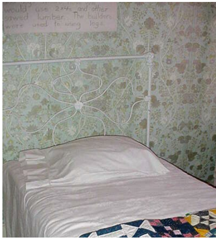
White iron Bed