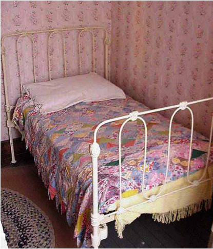
White iron bed, four by five feet.