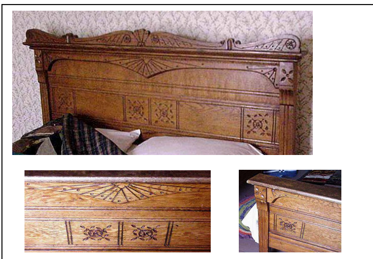
Golden oak antique bed, two woven spring mattresses, etchings on the head and foot boards.