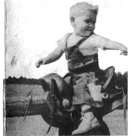
GRAND LAKE, COLORADO