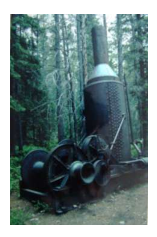
Donkey Engine Flume to bring logs to Monarch Lake