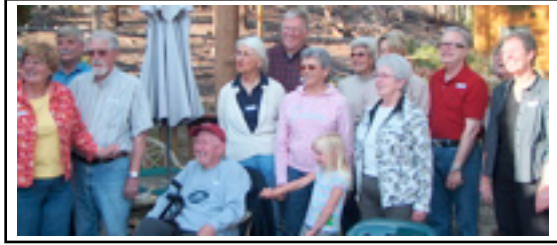
A few of the volunteers at last year's Volunteer Appreciation Dinner

These projects were funded in part by grants from the Grand Foundation and Grand County, and it's amazing to see how the parlor and upstairs original guest room have been transformed... taken back in time to their original styles.