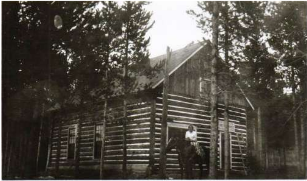
Pole Creek Ranger Station