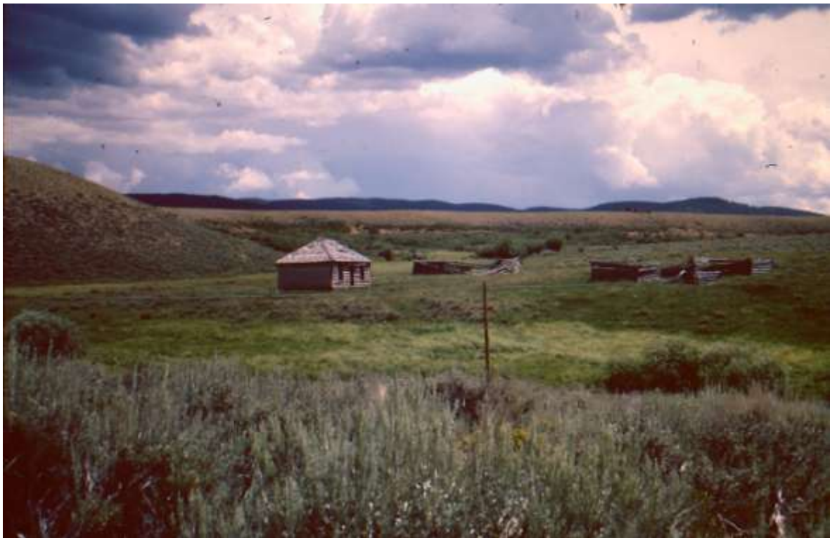
Old log buildings of Selak